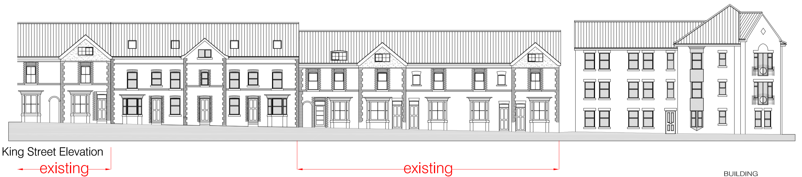
King Street Elevation