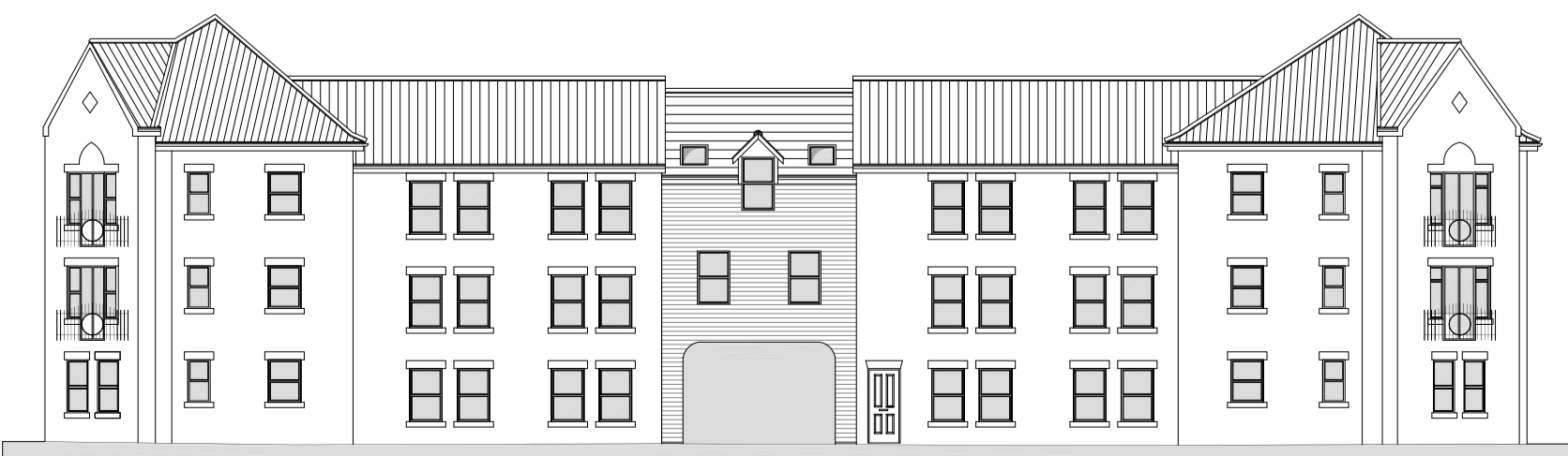
Beck Side Elevation

BUILDING DESIGN (BEVERLEY) LTD. Architects and Surveyors Moorgate House Beverley HU17 9BL Tel - 01482 869112 Fax - 01482 869104 Proposed Residential Development