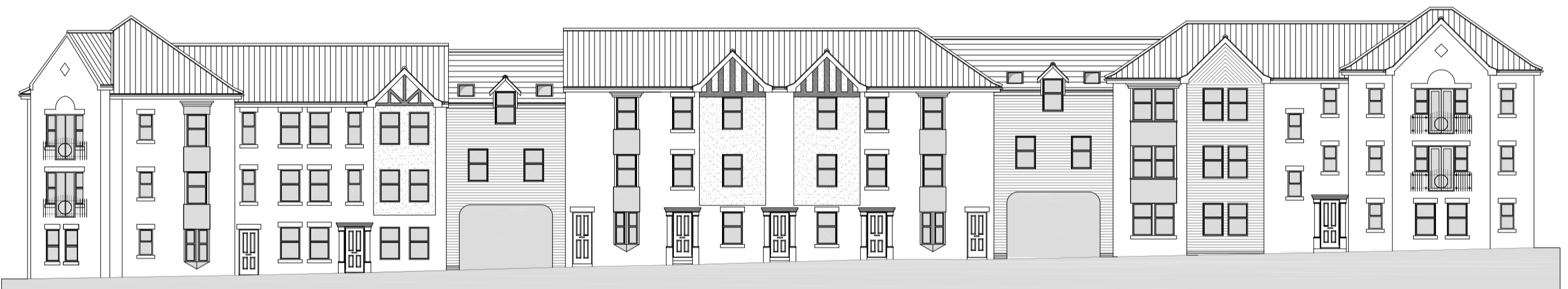
Queen Street Elevation (revised)